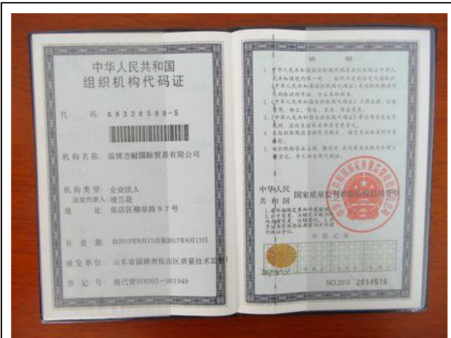
Certification & Photos -- Import and Export Enterprise Registration